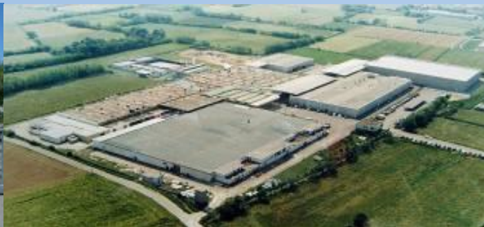
Weaving, printing, dyeing and finishing plant at Pontirolo Nuovo, near Milan