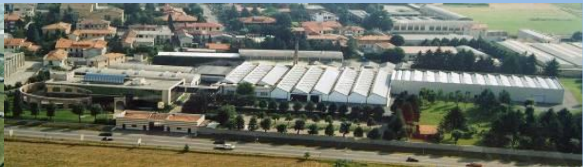
Head office, design centre and main warehouse at Sovico, near Como